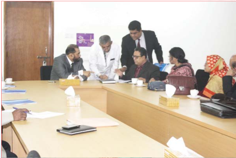
DGHS inspection on going