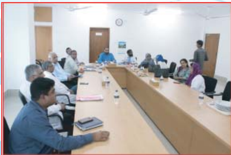
A Meeting at Conference Room