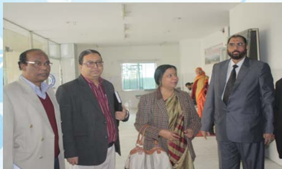
A team from DGHS inspecting the Hospital & College.

The ministry of Health and Family Welfare and Dhaka University are pleased in our academic performance and to increase the number of seats upto 110 in MBBS & upto 50 in BDS course last year.