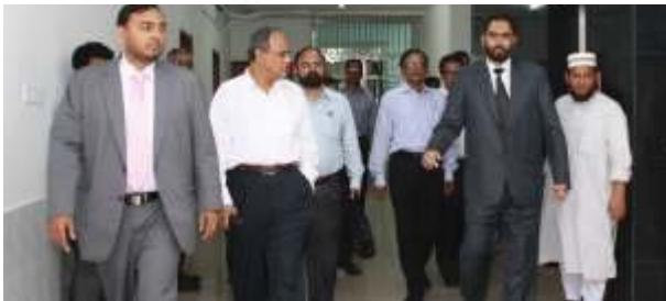
Dhaka University inspection team inspecting the Hospital & College.

MH Samorita Hospital & Medical College is affiliated with the University of Dhaka as a constituent college from 2010. Now the University of Dhaka has renewed the permission.