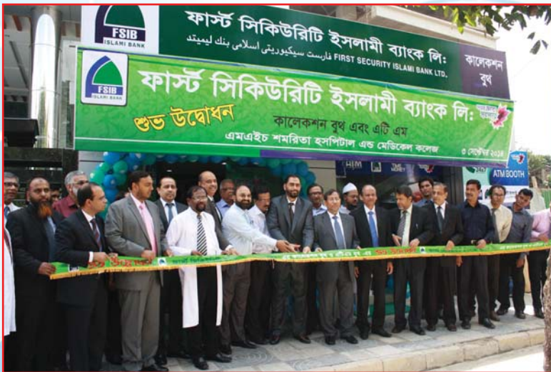
Bank Booth, ATM Booth, of First Security Islami Bank Ltd. for teachers, students and staffs.