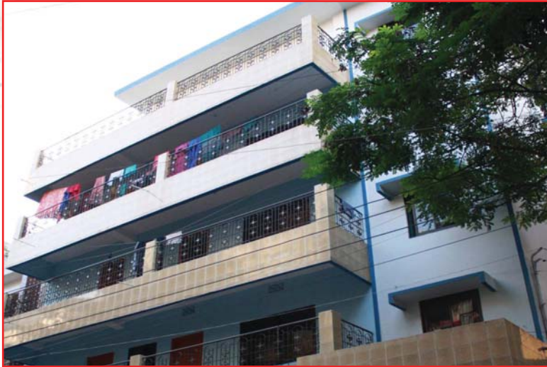
Hostel Facility for Students