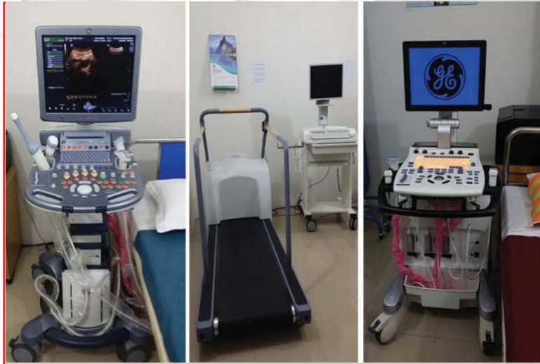
4D Ultrasound Machine ETT & ECO color Doplar Machine