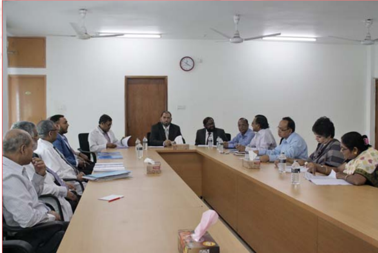
DGHS inspection team having meeting at our Conference Room.