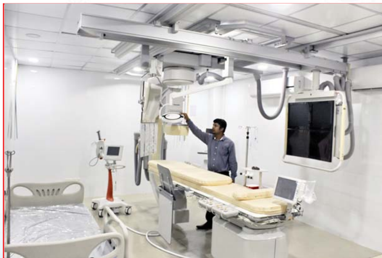
Latest Ceiling-mounted angiogram Machine (Cath Lab)