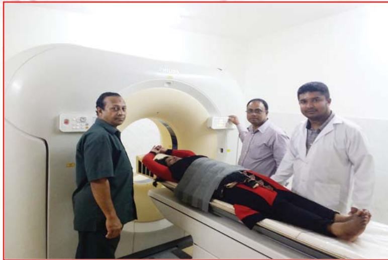
World most advanced 128 slice CT scan.