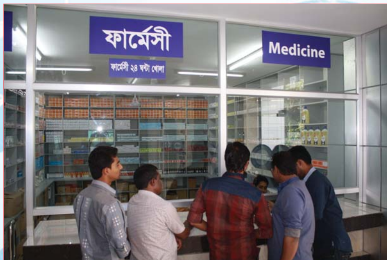
24 Hours Pharmacy