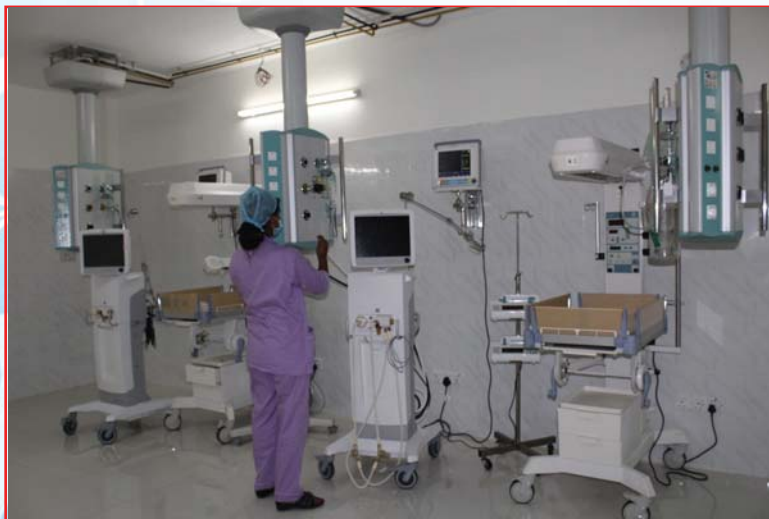
Most modern NICU with latest equip ment's (GE brand Neonatal Ventilators, baby incubators, phototherapy, baby warmer etc.)